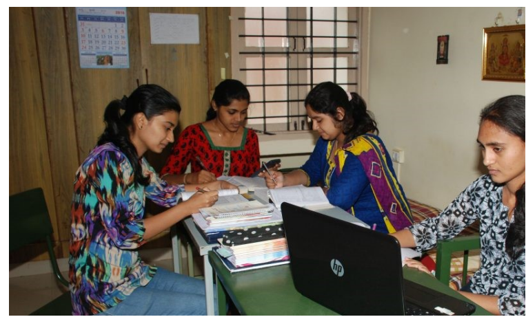
Medical & other Facilities at Hostel